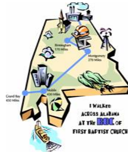
Walk across Alabama

Basketball at 6a.m.! A great way to have fun and enjoy fellowship and the game of basketball. This group meets every Monday, Wednesday, & Friday morning.