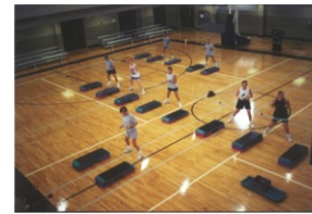
Step aerobics in the gym

A variety of fitness classes are offered at the ROC to keep your mind and body fit. Sessions are 8 weeks long and cost $20. Childcare is available for $15 dollars a session.